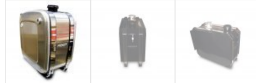
Hydraulic Side Mounting Oil Tank With Belts – TSB